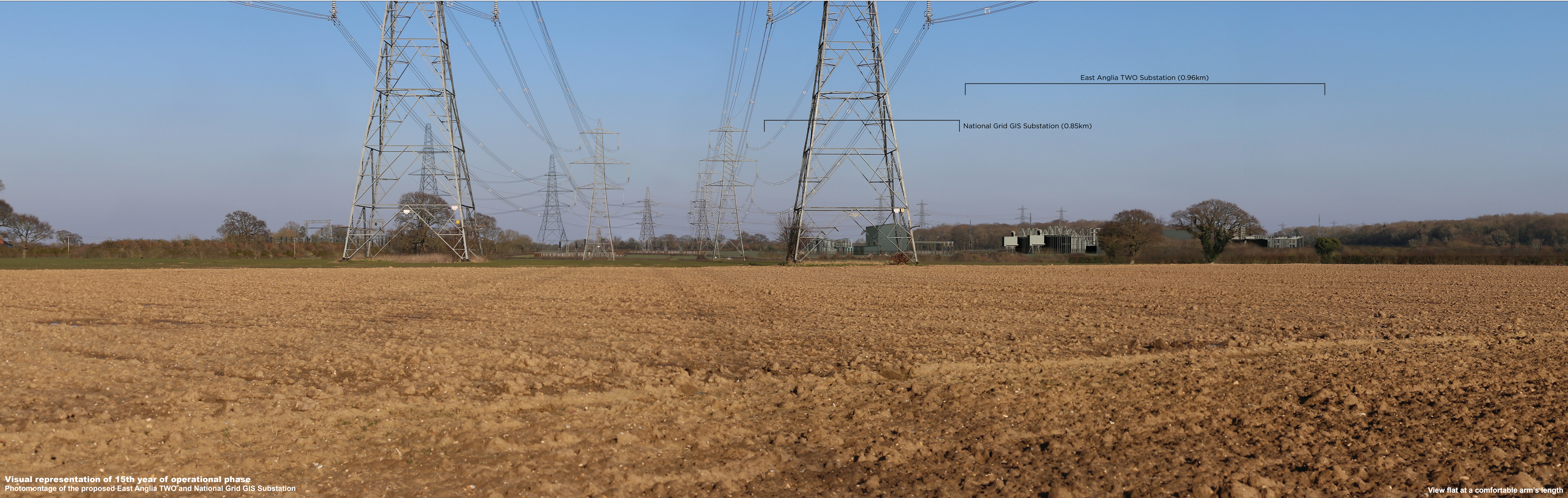
Visual representation of 15th year of operational phase Photomontage of the proposed East Anglia TWO and National Grid GIS Substation